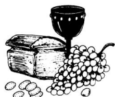
First Communion

sacrament of Confirmation. May the blessings of our faith community shower down upon them and may God hold them closely to Himself.