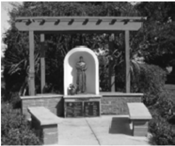
Pictured to the left is a shrine to Venerable (soon to be Blessed) Father Michael J. McGivney at Church of the Ascension.

The Knights of Columbus was founded as an extension of the Catholic Church to bring the Good News of the Gospel to as many people as possible by providing charitable and educational support to the community. We are known for the work we do. Our immediate charitable works extend to the Church of the Ascension, Queen of Apostles, Sacred Heart and St. Joseph of Cupertino parishes. In addition, we provide financial support to West Valley Community Services, Our Daily Bread, Habitat for Humanity, and other outreach groups where the need is greatest.